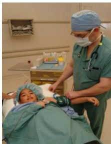
Blood Pressure Cuff