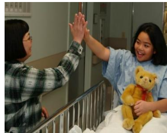
"See you later"