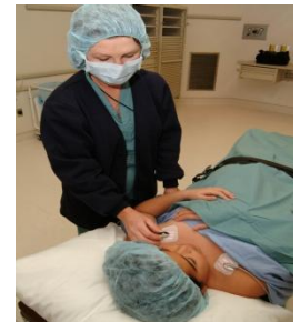
Heart Monitor Stickers