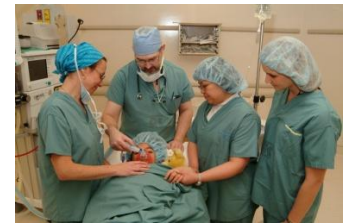
Mask on Face