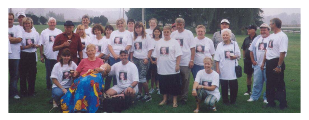
Participants at the golf tournament