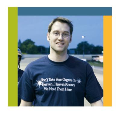
Kidney Transplant Program