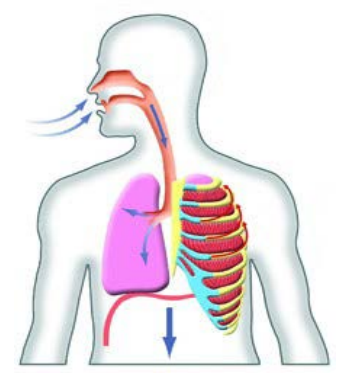
When the diaphragm contracts during breath in, it moves downward and opens up the lungs, causing air to flow into the lungs.

The primary muscle of breathing in is the diaphragm, a large muscle situated below the lungs.