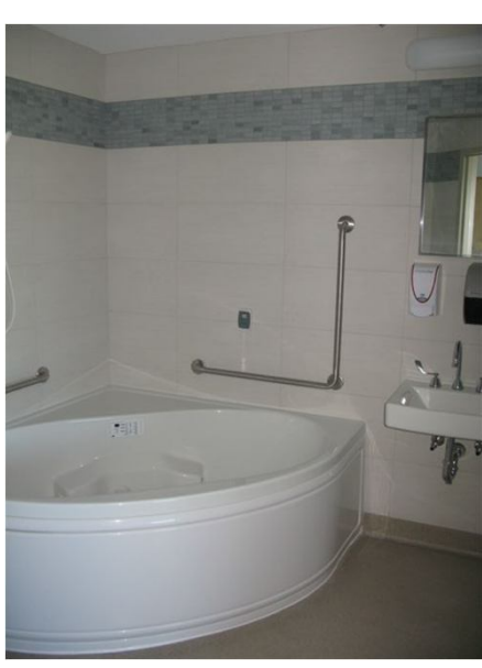
Labour and Birthing Patient Bathrooms