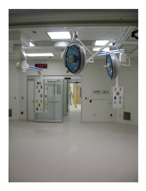
Labour and Birthing Operating Room