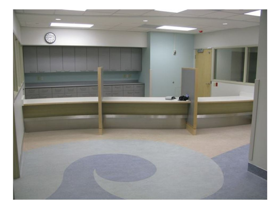
Labour and Birthing Registration Area