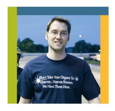
Kidney Transplant Program