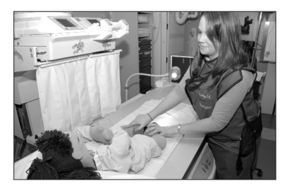
Position for boys.