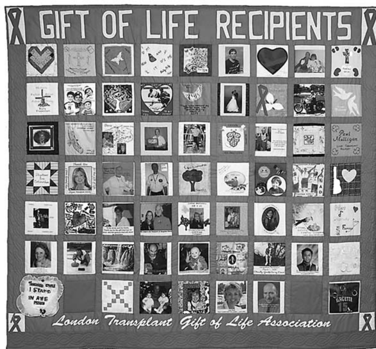
Recipient Gift of Life Quilt